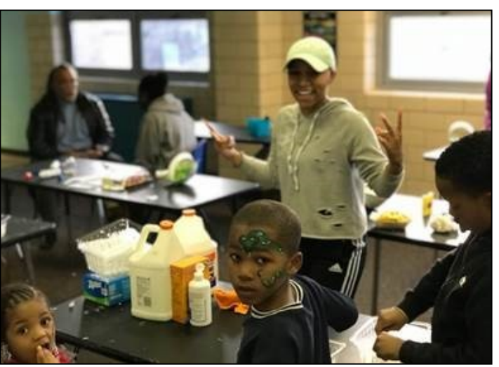
Youth and community members participating in activities at the Boys and Girls Club.

opportunities for employment to individuals who complete employability training with Jobs Plus Dayton and SOAR. Please call 937 875-1749 for more details.